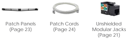
Patch Panels (Page 23)